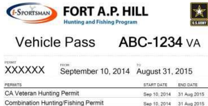
Sample Vehicle Pass